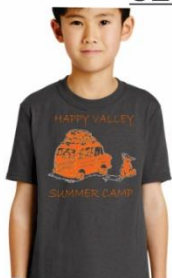
Youth Blended T-Shirt