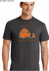
Adult Blended T-Shirt