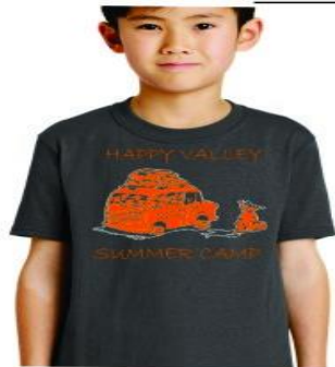
Youth Blended T-Shirt