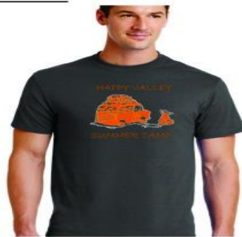
Adult Blended T-Shirt

ORDER DEADLINE MIDNIGHT May 7th DELIVERY TO HVS CAMP BY May 24rd.