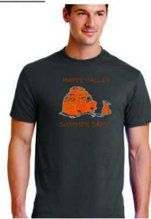
Adult Blended T-Shirt