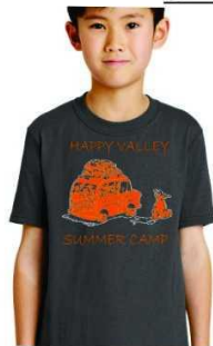
Youth Blended T-Shirt